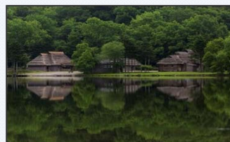
Lake Poroto and traditional Ainu houses