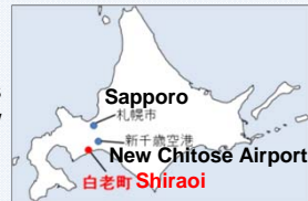
Location of Shiraoi